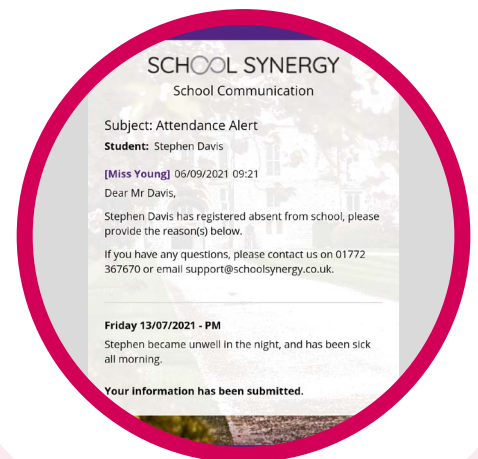
Click through to the message